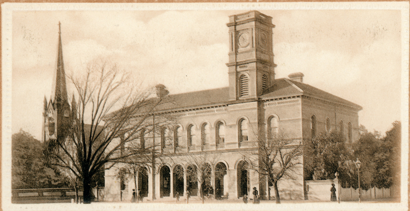
Post Office, Echuca.

Please drop the president a line at eh.soc@bigpond.com or mawilson85@gmail.com