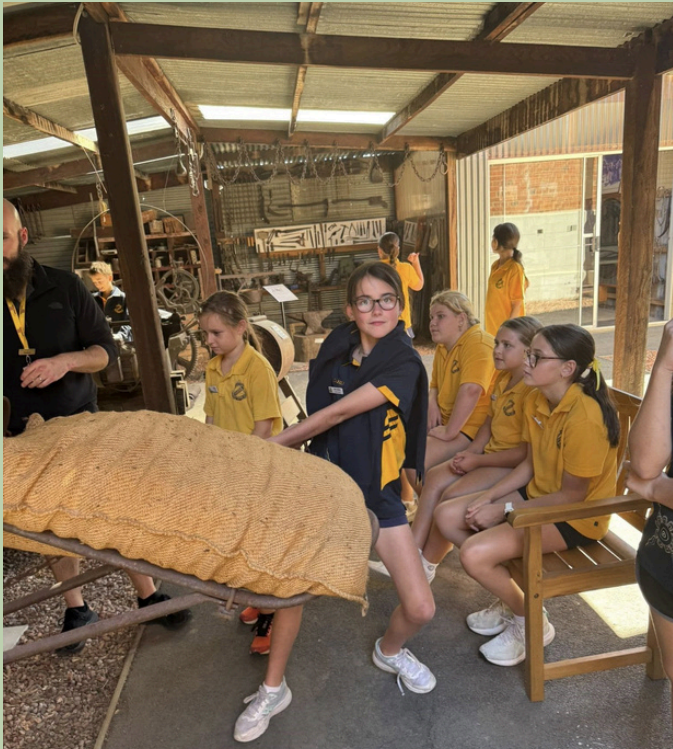
Top: School group visits