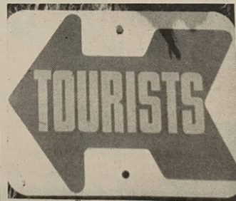
● A close-up view of one of the "Green Arrow Tour" signs.

ERDS says that a few amendments have been made to the original "red arrow tour" routes to enable tourists to see as much as possible on the best roads in the district.