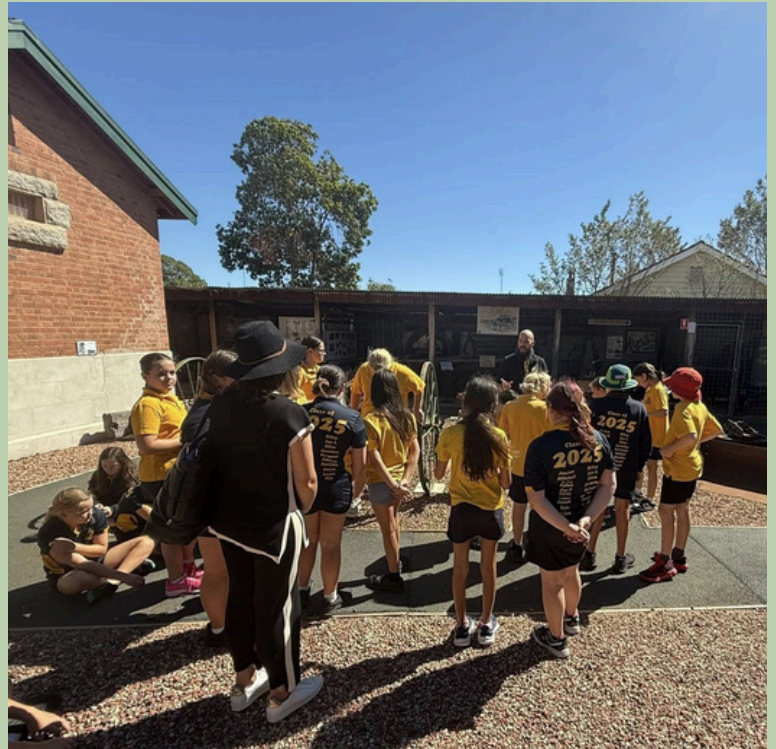
Bottom: Campaspe Port Enterprise celebrating 160 years of Rail