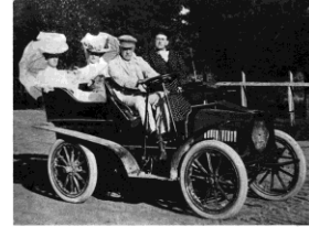
ECHUCA'S OWN CAR - 1908